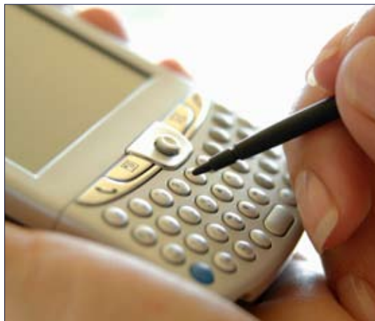
You can download and install patches from Microsoft to update your hand held, laptop or computer.

Microsoft has already released patches for most of the products on the above list. The patches can be easily downloaded off Microsoft's site by clicking the link on their home page titled Daylight Savings Time updates.