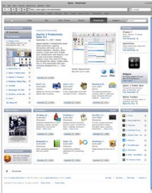
Download Screen for apple.com/downloads

most popular downloads, most recent and staff picks.